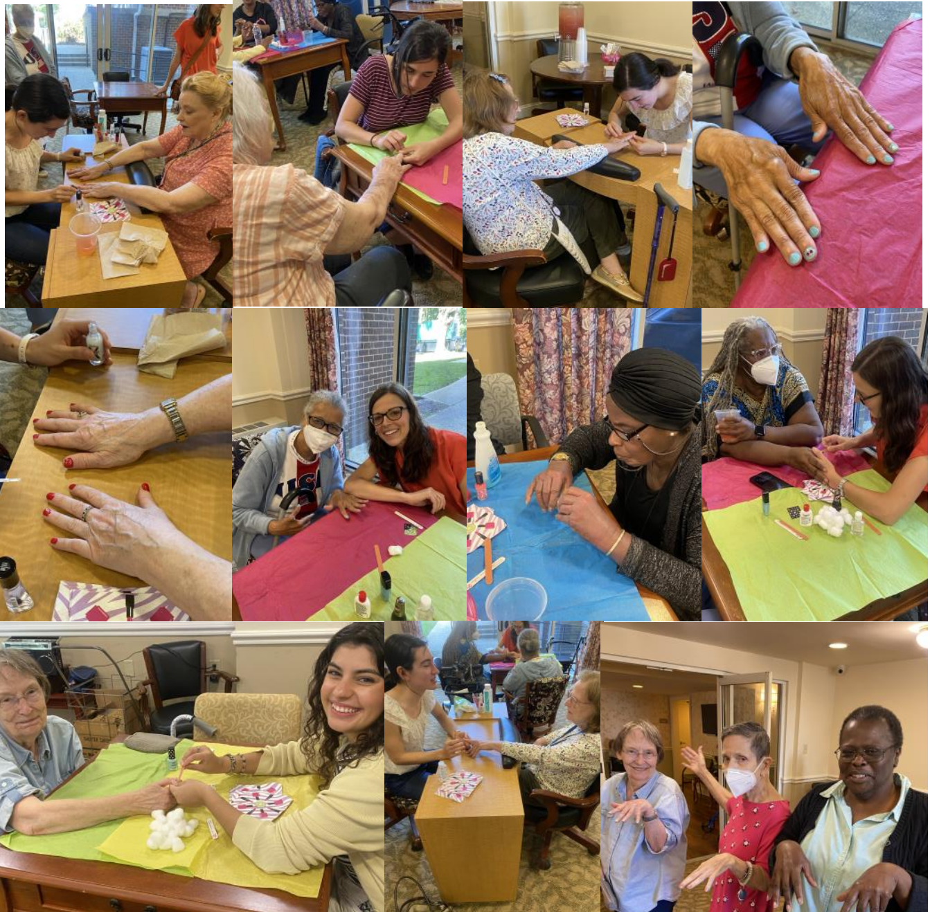
Friendship Terrace residents & volunteers from the Yuma Center College Program had a fun and relaxing nail day.